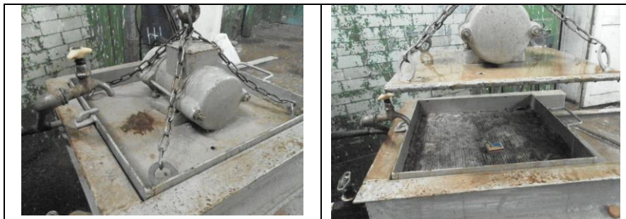
Fig. 2. The felting process of the wool

is pressed by the top vibrating plate was felted more strongly. At the end of the felting, samples were rinsed with hot water.