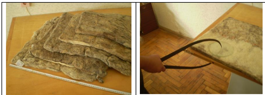
Fig. 3. The samples of felt

The researches results. On the obtained felt samples, the felt density \rho was determined - the initial function of the mathematical model of the process - through measuring the geometric dimensions, width, length and mass of the samples in accordance with Figure 3.